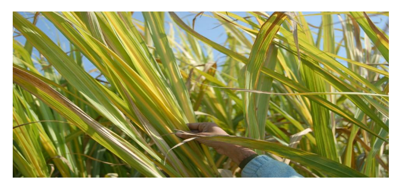
Fig. 1a:- Yellowing is expending from midrib to margins of the leaves.

The yellowing appears on the leaves. It expands out from the leaf midrib into the leaf blade during the growth development stages of the plant. Fig.1a. Then the tip of the leaf tuned yellow with necrotic tissues. Fig.1b.