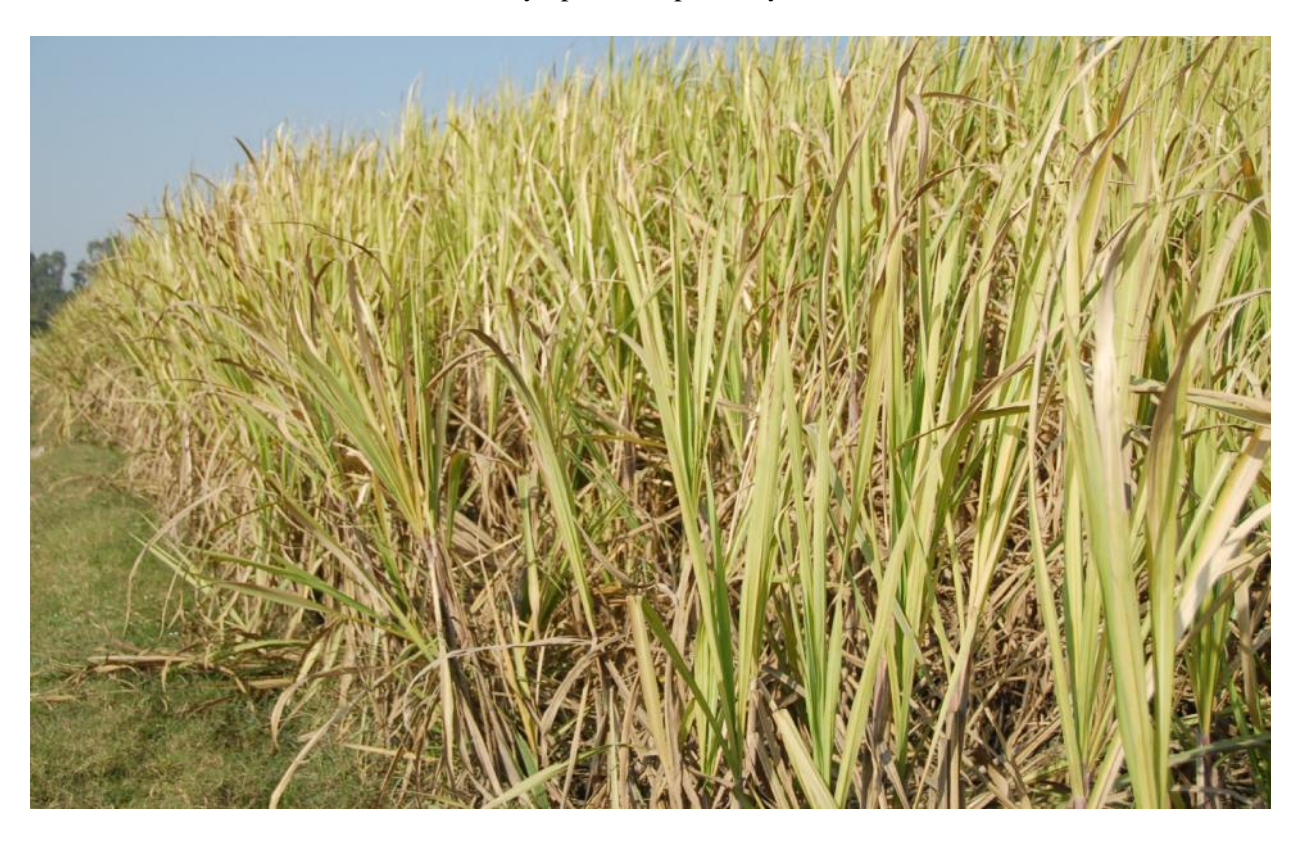
Fig.2b:- Whole of the field is infected.