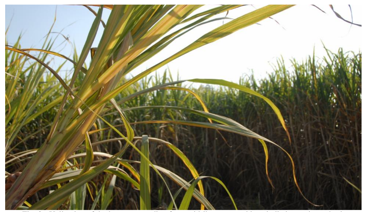
Fig. 3:- Yellowing of the leaves expanding from midrib to outward in spindle leaves in a whorl.

that cold and nutrient deficiency promotes the symptoms rapidly. Other characteristic symptoms of the disease are accumulation of sucrose in the leaf and shorting of terminal internodes developing a fan like appearance. Water stress, biotic and other abiotic factors expedite the disease appearance. Initially the young leaves are more affected by showing the yellowing symptoms. Crops cultivated in both seasons (September sowing and Feb. sowing) show the yellowing symptoms.