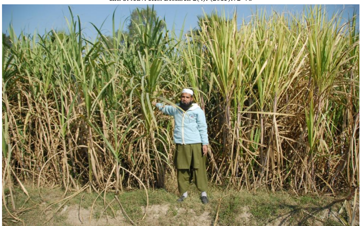
Fig.2a, The disease appear in patches. Left side of the person is healthy and right side showing yellow leaf disease symptoms respectively.